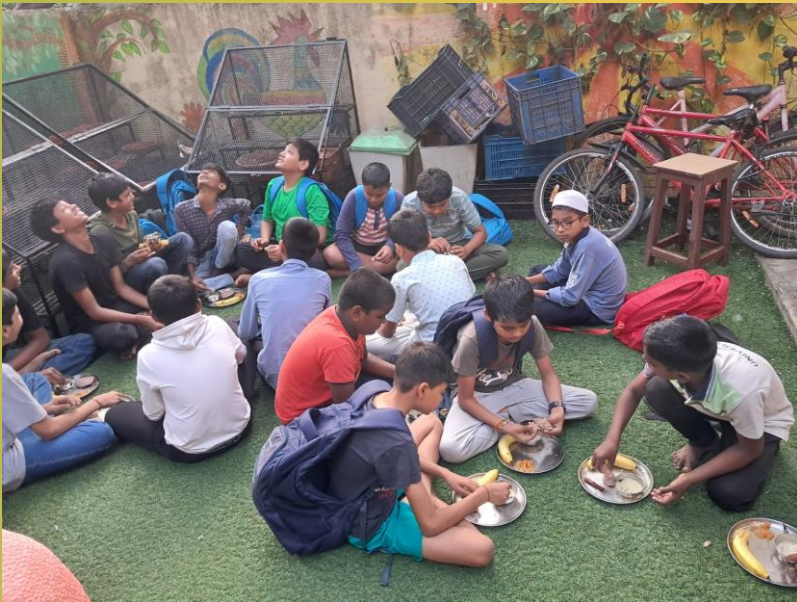
December 7 th