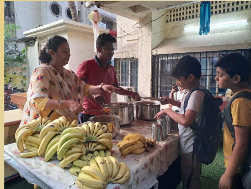
December 14 th